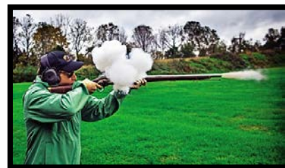
Thursday Field Trip