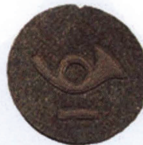
25. BUGLER FIRST CLASS.