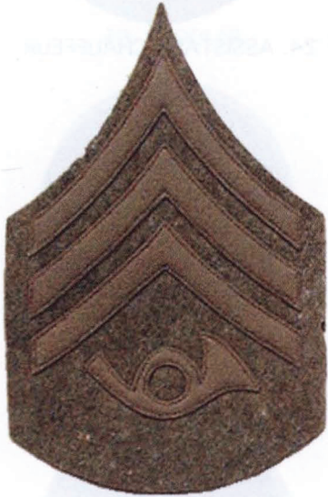
14. SERGEANT BUGLER.