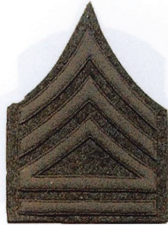
4. BATTALION AND SQUADRON SUPPLY SERGEANT.