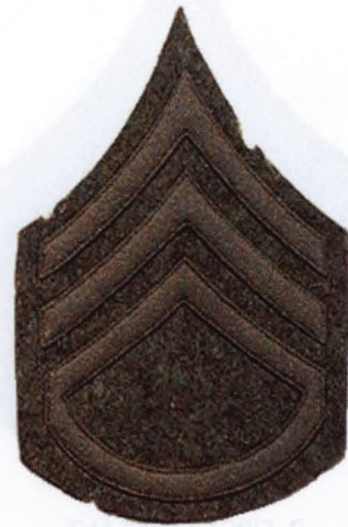
5. SERGEANT FIRST CLASS.