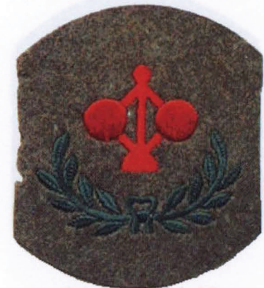
36. ASSISTANT ENGINEER C.A.C. OILER MINE PLANTER SERVICE.