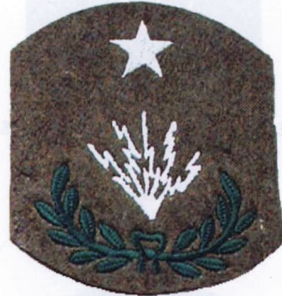
34. MASTER ELECTRICIAN C.A.C.