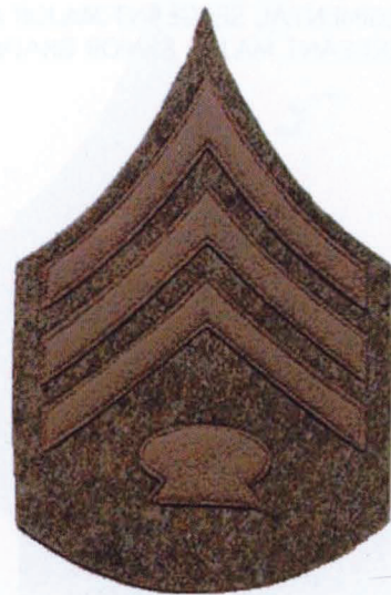
11. MESS SERGEANT.