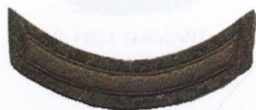
21. PRIVATE FIRST CLASS ALL ARMS AND DECKHAND MINE PLANTER SERVICE.