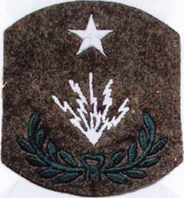
54. MASTER SIGNAL ELECTRICIAN SIGNAL CORPS.