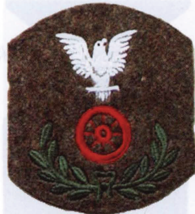
51. MASTER ENGINEER SENIOR GRADE CORPS OF ENGINEERS.