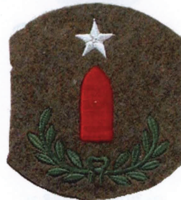
41. MASTER GUNNER C.A.C.