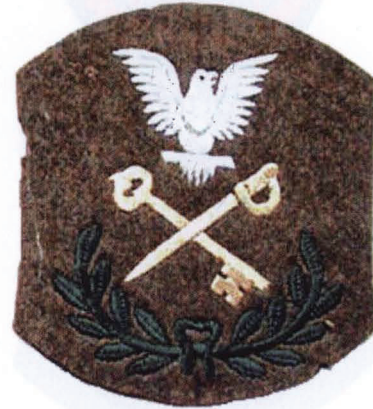
58. QUARTERMASTER SERGEANT JR. GR. QUARTERMASTER CORPS.