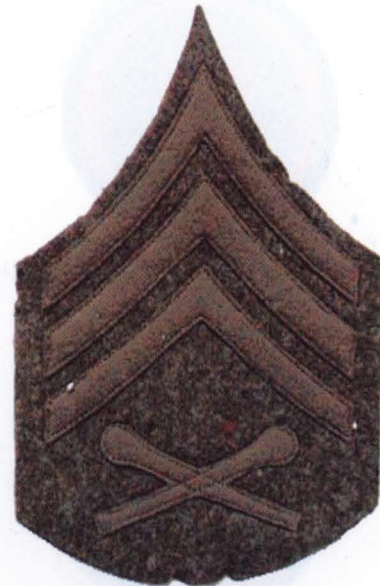
59. DRUM MAJOR.