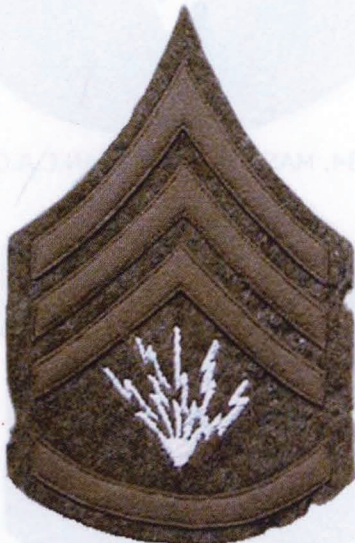
38. ELECTRICAL SERGEANT SECOND CLASS C.A.C.