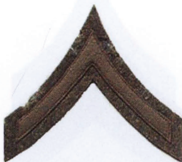
20. LANCE CORPORAL.