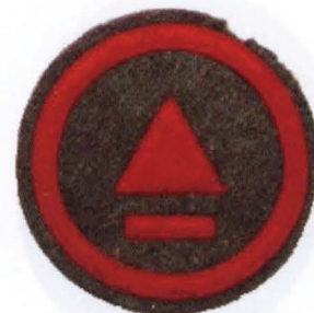
43. OBSERVER FIRST CLASS C.A.C.