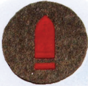
67. FIRST CLASS GUNNER FIELD ARTILLERY AND GUN AND MOTOR CO. C.A.C.