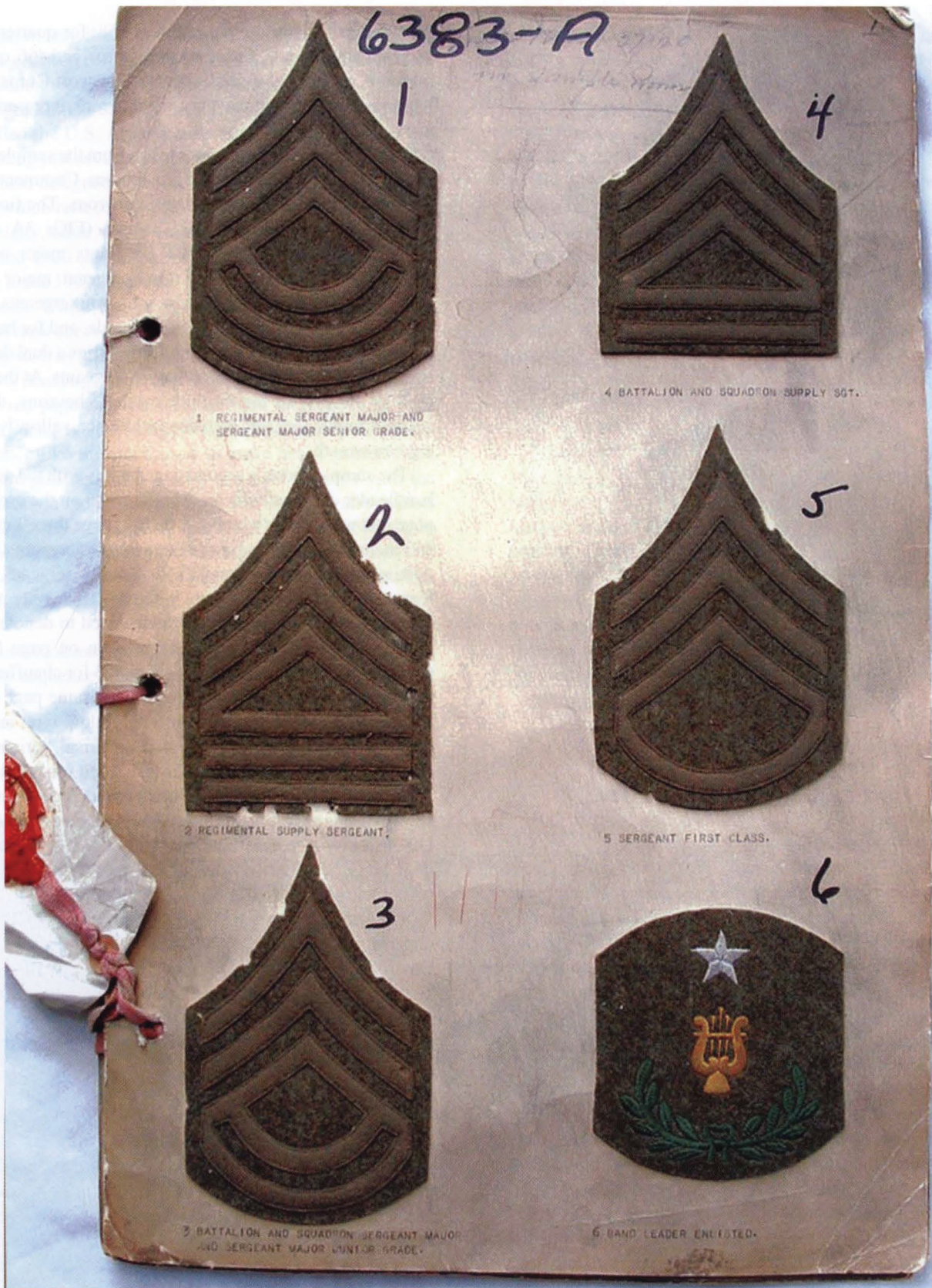
FIG 3A. Page one of the sample book. Because of the reduction in size and condition of the mounting cardboard, this page is repeated opposite, with the chevron images extracted from the pages, while keeping them in the same order as they appear on the page, with readable labels applied. Pages 2 through 10 follow in the same reconstructed format.