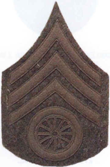
15. MOTOR SERGEANT.