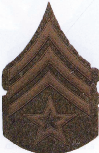
9. COLOR SERGEANT.