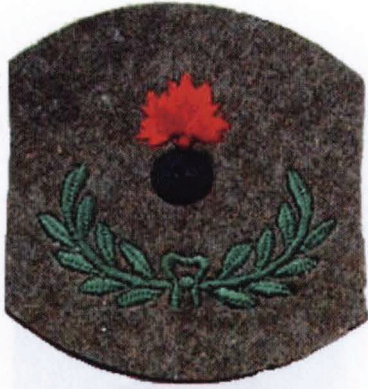
53. ORDNANCE SERGEANT.