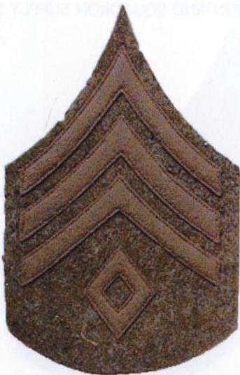
8. FIRST SERGEANT.