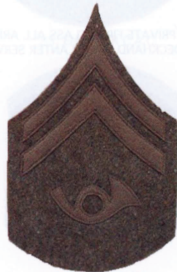
18. CORPORAL BUGLER.