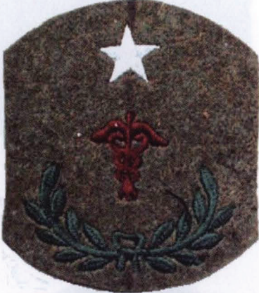
55. MASTER HOSPITAL SERGEANT.