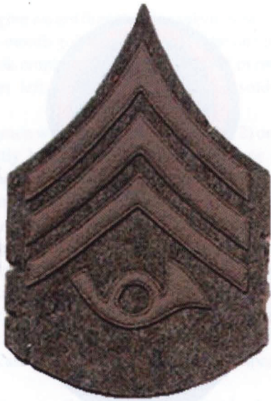
60. SERGEANT OF FIELD MUSIC.