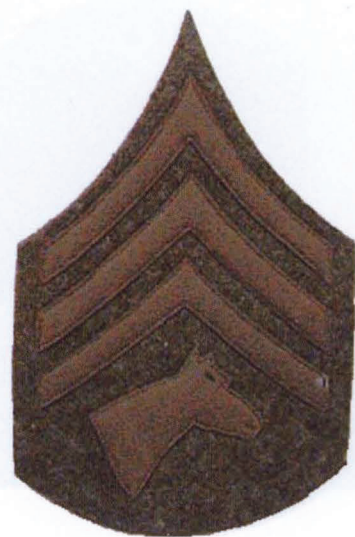
12. STABLE SERGEANT.