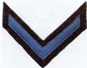
74. WAR SERVICE.