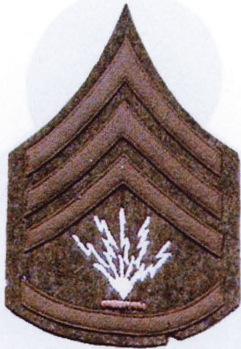
37. ELECTRICIAN SERGEANT FIRST CLASS C.A.C.