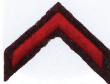
76. DISCHARGE CHEVRON.