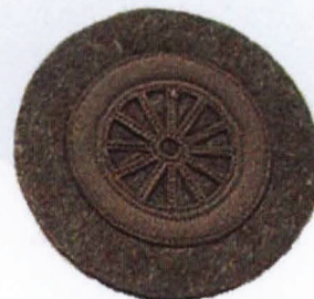
24. ASSISTANT CHAUFFEUR.