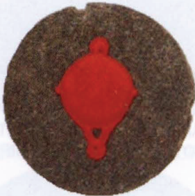
70. SECOND CLASS GUNNER MINE CO. C.A.C.