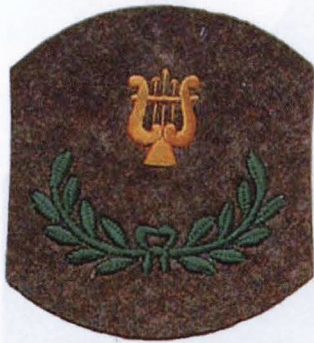
7. ASSISTANT BAND LEADER.