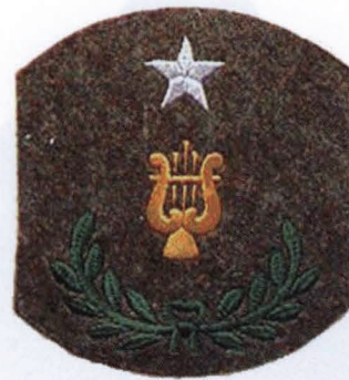
6. BAND LEADER ENLISTED.