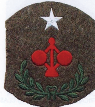
35. ENGINEER C.A.C.