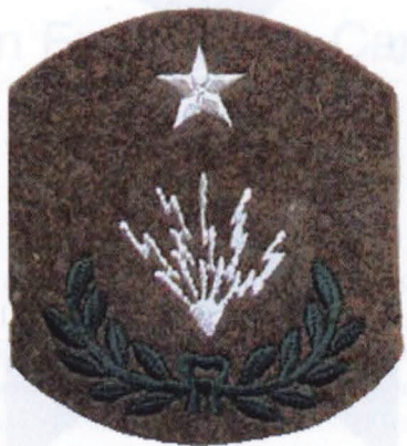
62. MASTER SIGNAL ELECTRICIAN AIR SERVICE.