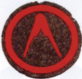
45. PLOTTER C.A.C.