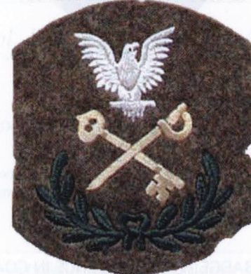
66. QUARTERMASTER SERGEANT JR. GR. MOTOR TRANSPORT CORPS.