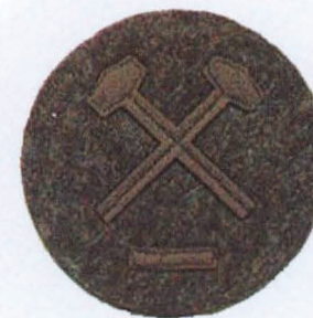
27. CHIEF MECHANIC.