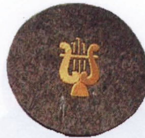
33. MUSICIAN FIRST, SECOND, AND THIRD CLASS.