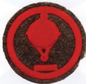
47. CHIEF PLANTER C.A.C.