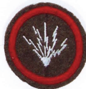
42. CASEMATE ELECTRICIAN C.A.C.