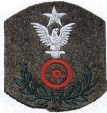
63. MASTER ENGINEER SENIOR GRADE TRANSPORTATION CORPS.