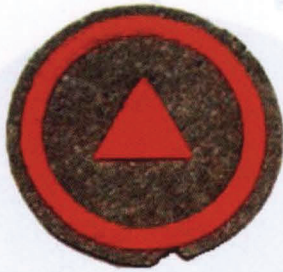
44. OBSERVER SECOND CLASS C.A.C.