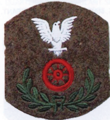
52. MASTER ENGINEER JUNIOR GRADE CORPS OF ENGINEERS.