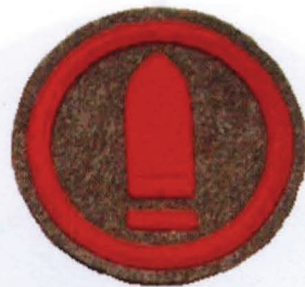
72. EXPERT GUNNER C.A.C.