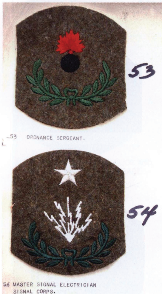
FIG 2. Closeup of chevrons 53 and 54.

for the first time, a background of heavy felt.