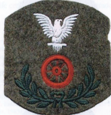
64. MASTER ENGINEER JUNIOR GRADE TRANSPORTATION CORPS.