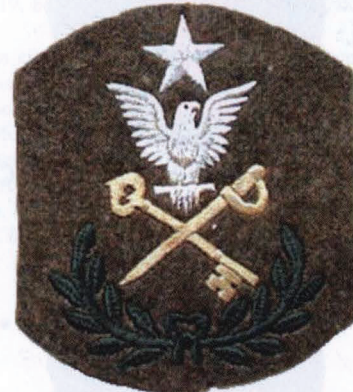
65. QUARTERMASTER SERGEANT SR. GR. MOTOR TRANSPORT CORPS.