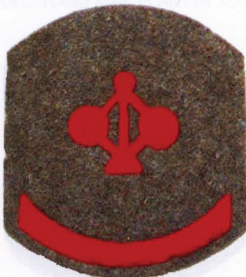
39. FIREMAN C.A.C. FIREMAN MINE PLANTER SERVICE.