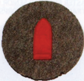
68. SECOND CLASS GUNNER FIELD ARTILLERY AND GUN AND MOTOR CO. C.A.C.