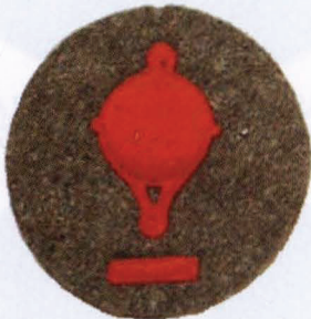
69. FIRST CLASS GUNNER MINE CO. C.A.C.