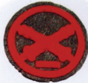
49. GUN COMMANDER C.A.C.