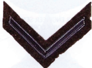
75. WAR SERVICE.