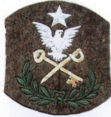
57. QUARTERMASTER SERGEANT SENIOR GRADE QUARTERMASTER CORPS.