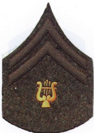
19. BAND CORPORAL.