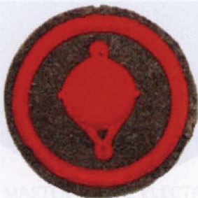
48. CHIEF LOADER C.A.C.