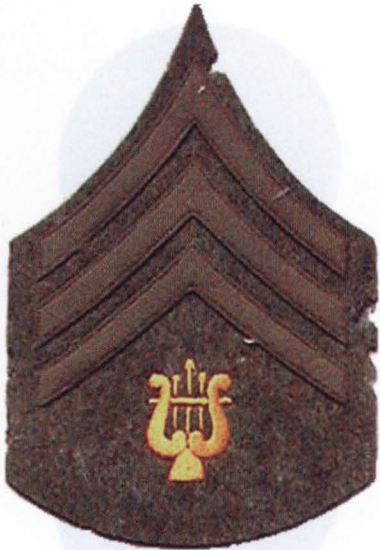
13. BAND SERGEANT.