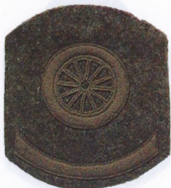
22. CHAUFFEUR FIRST CLASS.