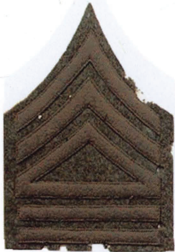
2. REGIMENTAL SUPPLY SERGEANT.