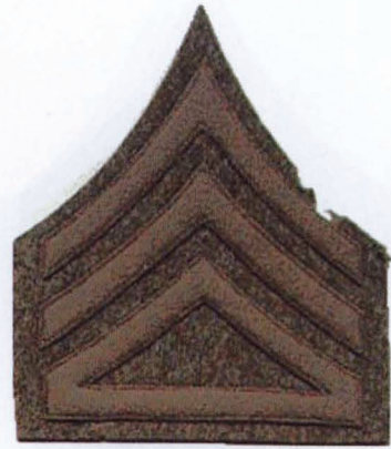
10. SUPPLY SERGEANT.