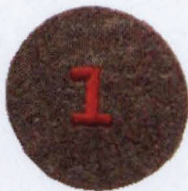
71. BADGE FOR EXCELLENCE IN COAST ARTILLERY PRACTICE.