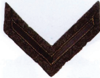
73. WOUND AND WAR SERVICE.