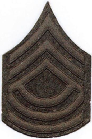
1. REGIMENTAL SERGEANT MAJOR AND SERGEANT MAJOR SENIOR GRADE.