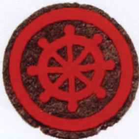
46. COXSWAIN C.A.C.