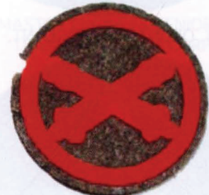
50. GUN POINTER C.A.C.