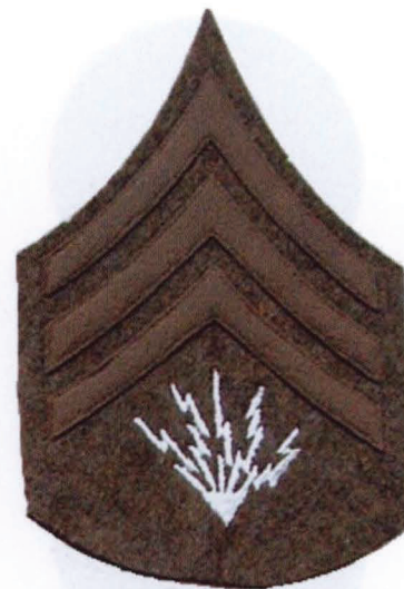
40. RADIO SERGEANT C.A.C.