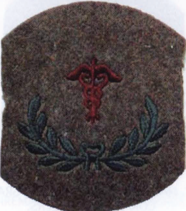
56. HOSPITAL SERGEANT.