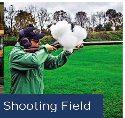
Shopping & Shooting Field