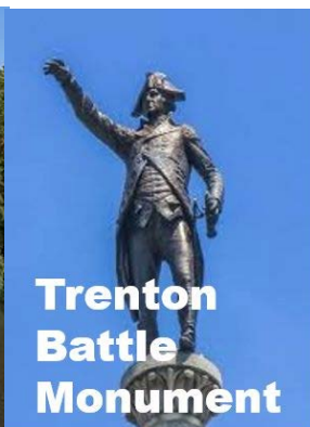
Trenton Battle Monument