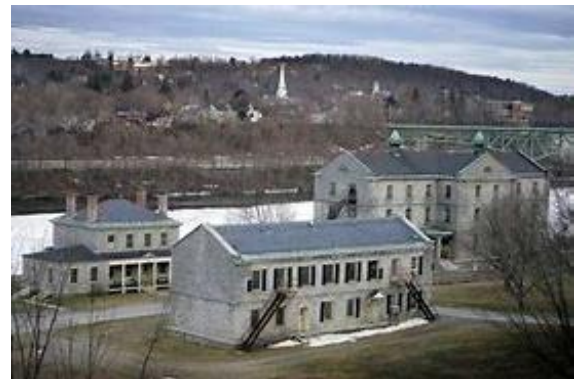
Kennebec Arsenal (1828)

On Sunday, we will be arranging optional, post-conference tours and activities for those who wish to stay on longer during the extended Memorial Day weekend. This meeting will be a great opportunity to renew old friendships and create new ones, while exploring the history and scenic beauty of Maine and sampling the food, drink and hospitality of the region. Please feel free to contact me in the interim with any questions or concerns.