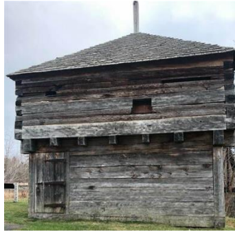
Fort Halifax (1752)