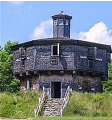
Fort Edgecomb (1809)