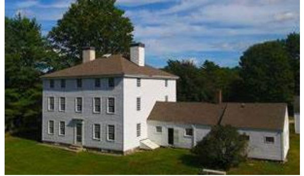
Pownalsborough Courthouse/Fort Shirley