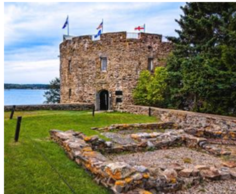
Fort William Henry at Pemaquid (1692)