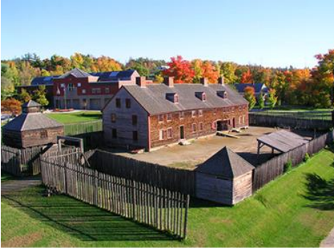
Fort Western (1754)