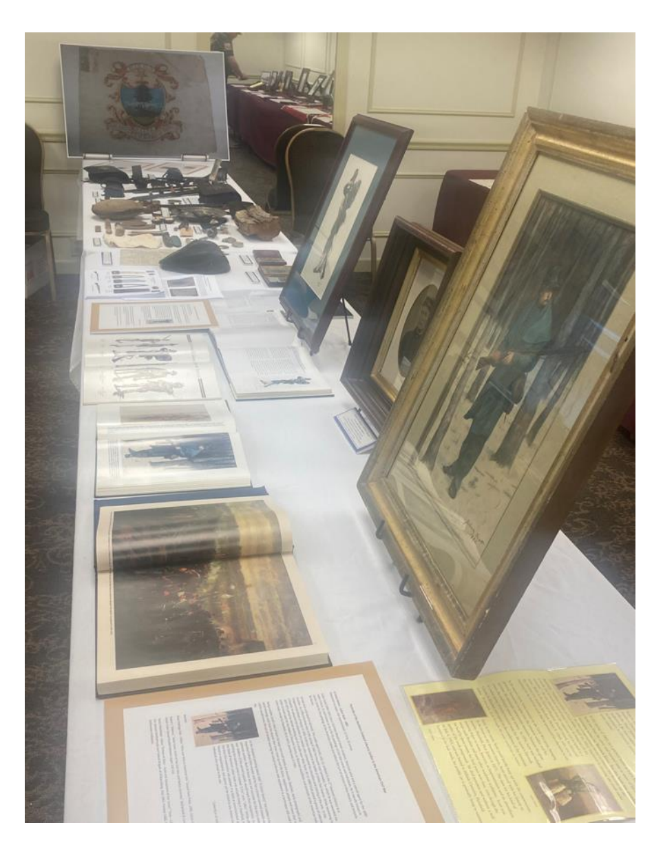
"Assorted ID'ed Items from Civil War Militias"