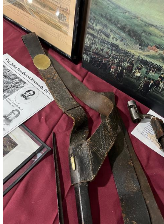
1808 Shield and Sling Bayonet rig (1812) Fred Gaede collection