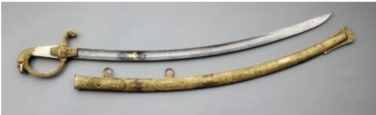
Figure 1 Saber and Scabbard

This gilded brass and steel saber was commissioned by French volunteers who fought in the American Revolution for President George Washington. The handle and scabbard of the saber consist of gilded brass. The French Government donated it to President Franklin D. Roosevelt in 1933. Klingenthal Armory, circa 1799-1800