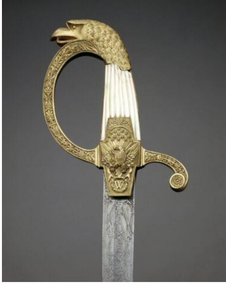
Figure 2 Detail of Hilt and top of Blade

An exceptionally rare commemorative saber associated with the American Revolution. This saber was commissioned by French volunteers who fought in the American Revolution. It is similar to the one presented to President Franklin Delonor Roosevelt in 1933 by the French Government. Manufactured by Klingenthal Armory, circa 1799-1800. The curved steel blade has a clipped point and is decorated with etching with traces of blueing and gold gilding and bears the Klingenthal inscription. The hilt is made of bronze and has a bas-relief image of an eagle with the letter "W" underneath it within a wreath. The pommel is made in the shape of an eagle's head. The grip is made of mother-of-pearl. The brass scabbard is decorated with chased plates depicting ancient gods. A similar example is on display at the White House.