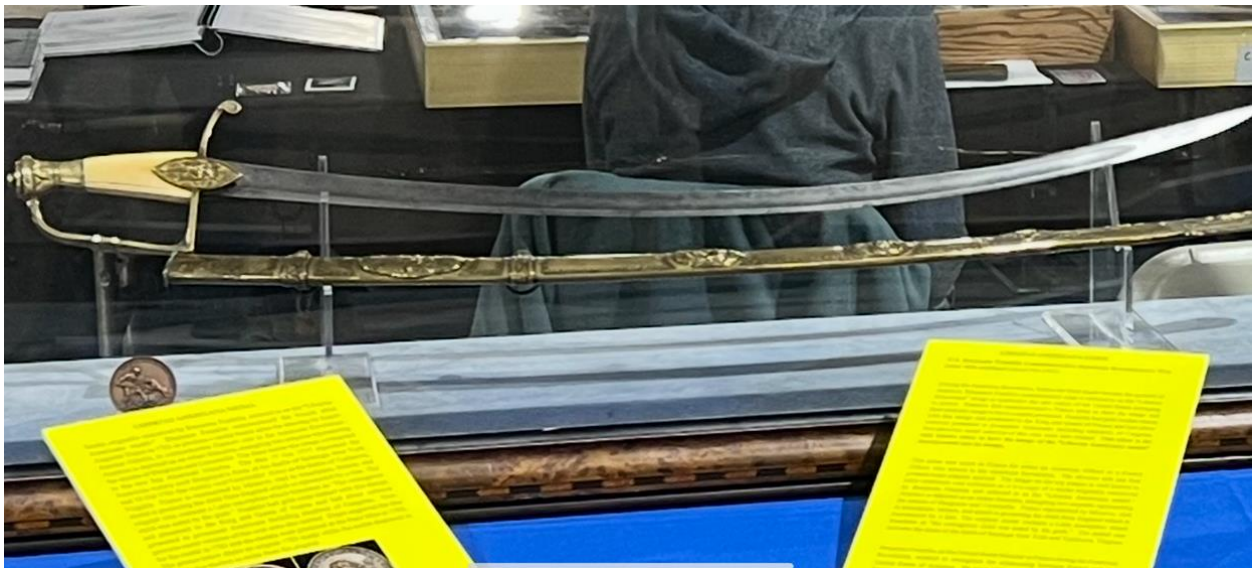
circa 1783 French made Libertas Americana Saber. The only known sword to incorporate the Libertas Americana image designed by Benjamin Franklin while Minister to France during the American Revolution